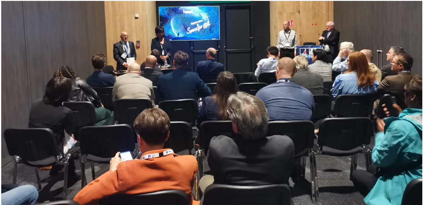
Interstellar Session: Strategies for Rapid Implementation of Interstellar Missions - Precursors and Beyond